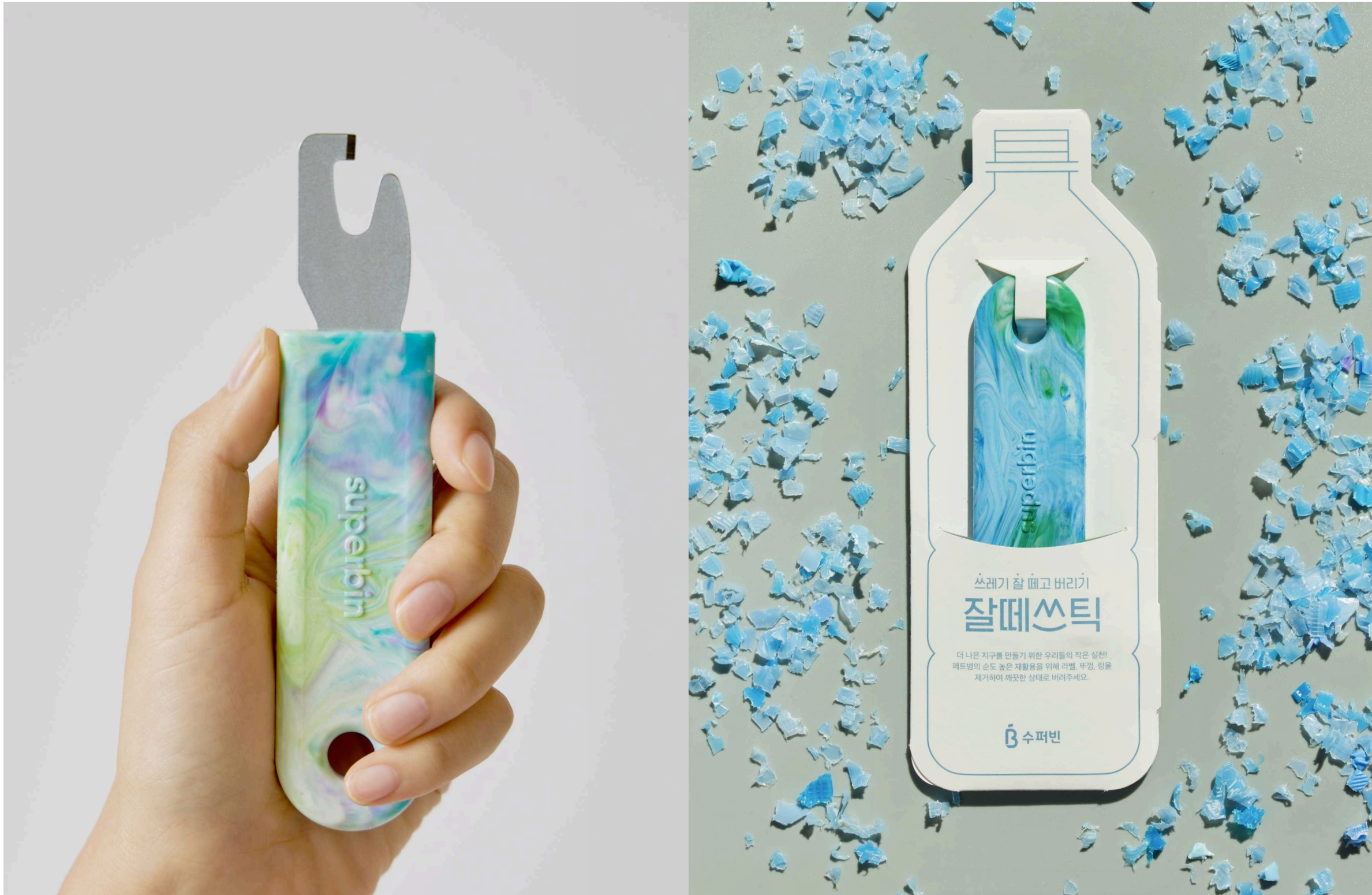
Option 01-A) Jalte-Stick (Random Colors)

*For additional options, reservations must be made at least 10 days prior to the visit date. *Availability may be limited depending on stock. *All prices listed below include VAT.