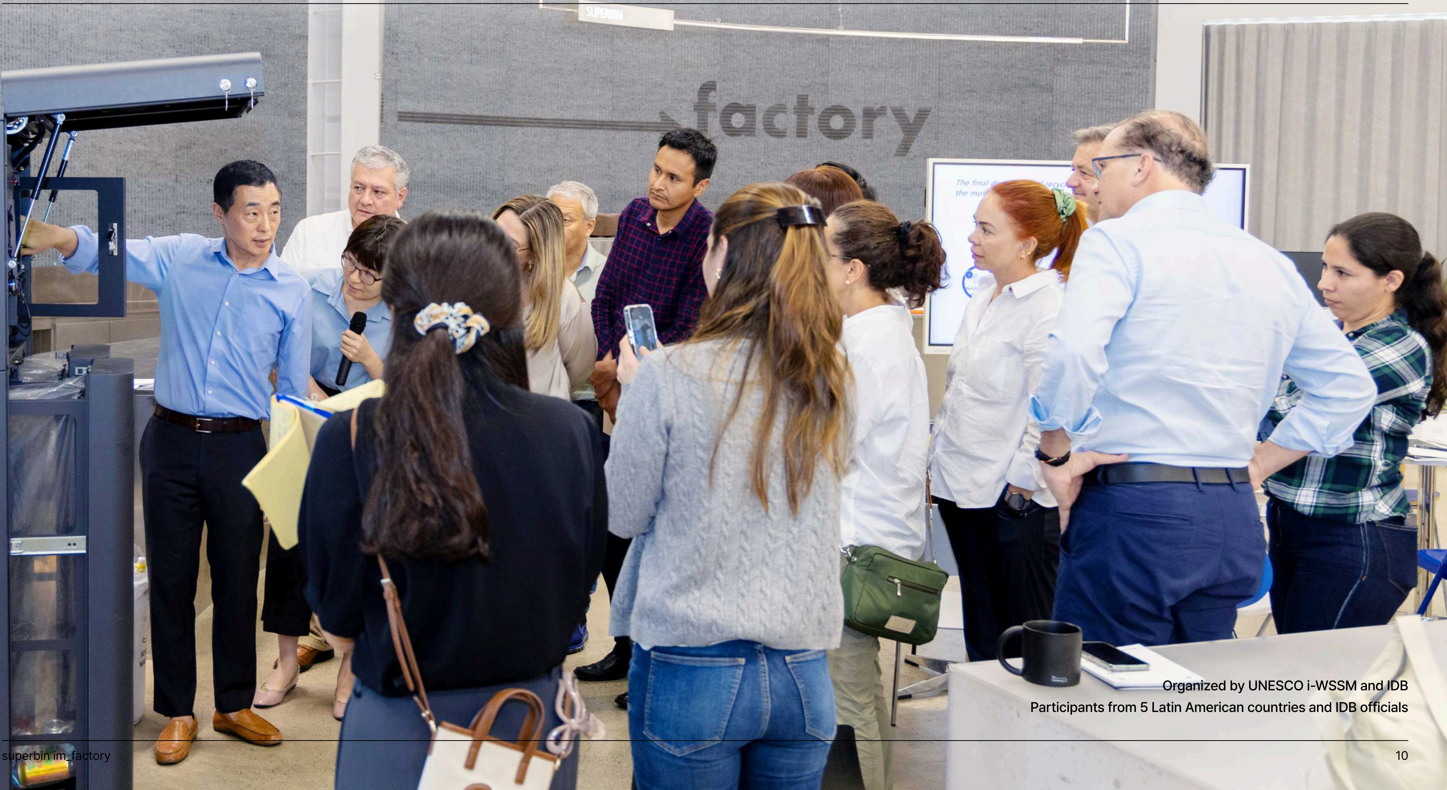
Organized by UNESCO i-WSSM and IDB Participants from 5 Latin American countries and IDB officials

Invitation Training Program on Integrated Water and Waste Management Consulting for Latin American Countries