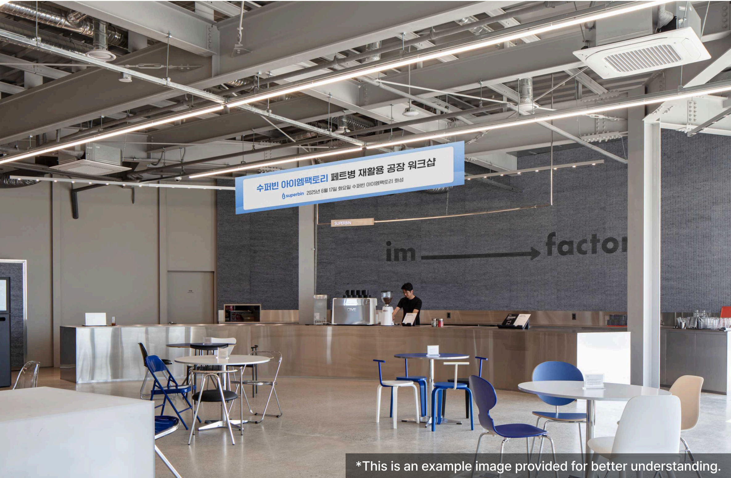
*This is an example image provided for better understanding.