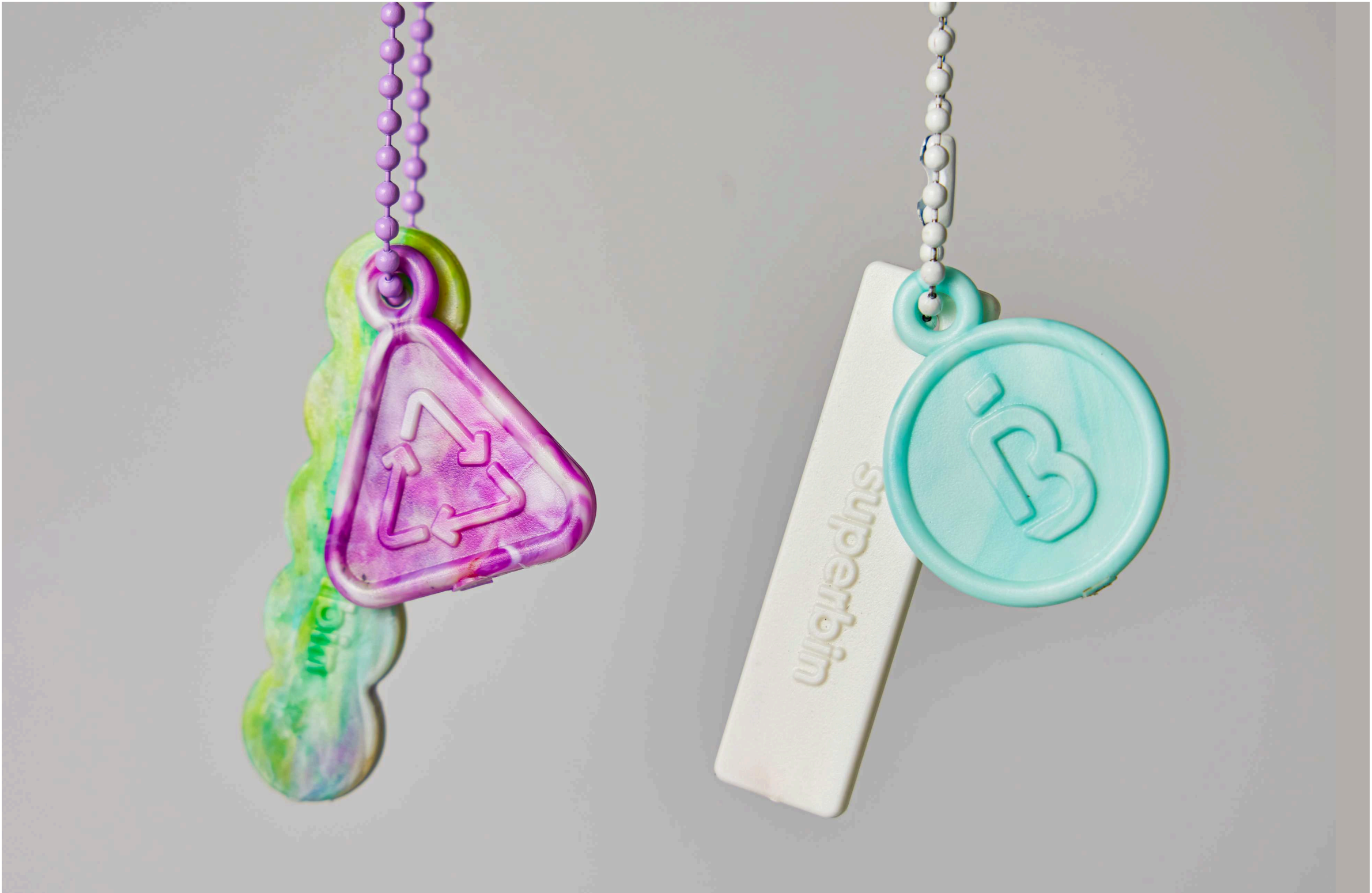
Option 01-B) Upcycled PET Bottle Cap Keyring (Random Colors)

The Jalte-Stick is a tool made by upcycling PET bottle caps. It is designed to help with proper recycling by allowing users to easily remove labels and rings from PET bottles. Due to the nature of upcycled products, color selection is not available and will be provided at random.